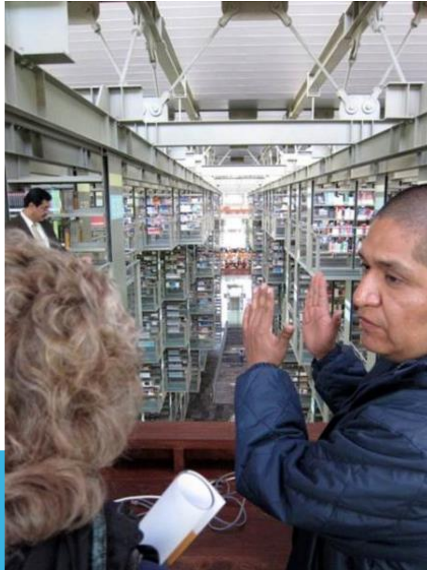
biblioteca vasconcelos, mexico city