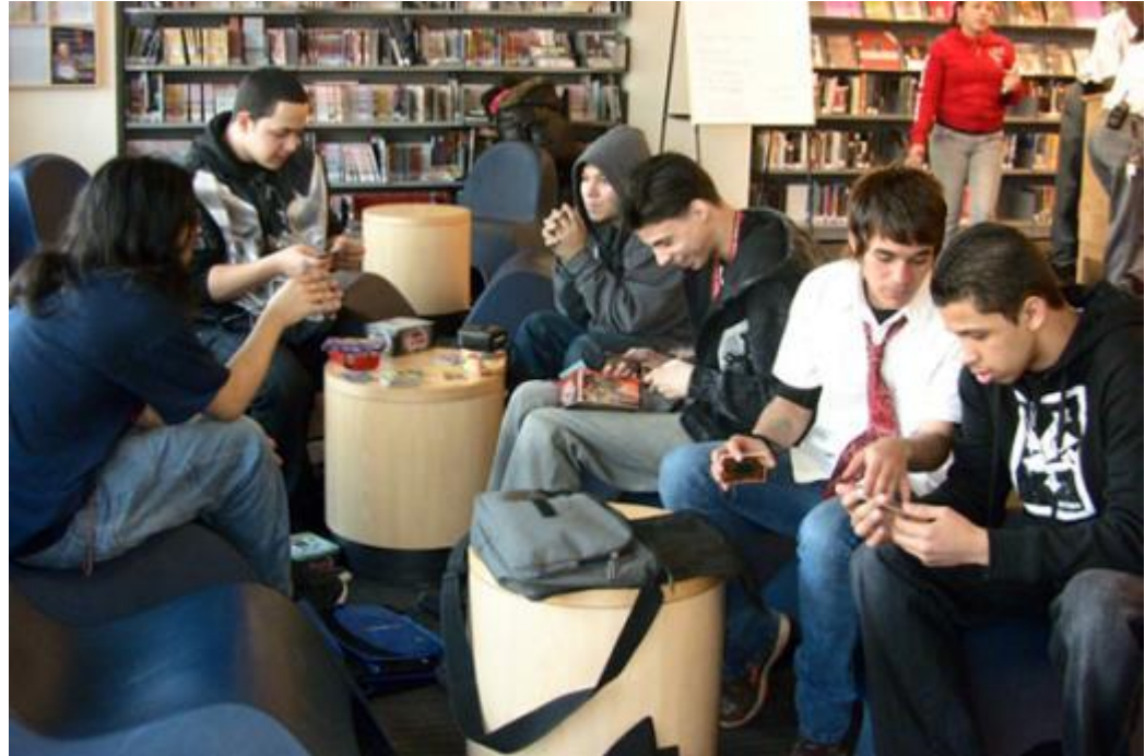
bronx library center, new york